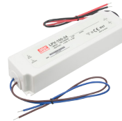
LED-DR 100 Driver (100W capacity)

LED-DR60-24 (24V DC) LED-DR60-12 (12V DC)