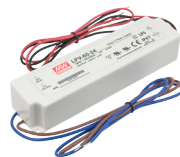
LED-DR 60 Driver (60W capacity)

LED-DR30-24 (24V DC) LED-DR30-12 (12V DC)