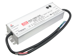
LED-DR 150 Driver (150W capacity)

LED-DR100-24 (24V DC) LED-DR100-12 (12V DC)